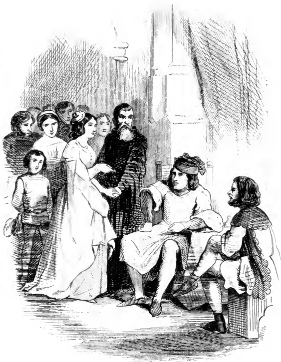
THE GUILTY WIFE